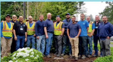
LAKWOOD WATER DISTRICT SERVICE CREW