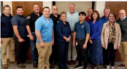
LAKWOOD WATER DISTRICT MANAGEMENT TEAM