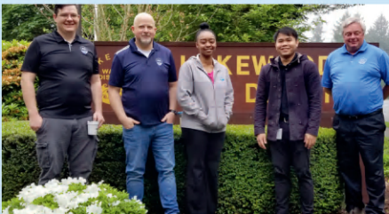
LAKWOOD WATER DISTRICT ACCOUNTING/IT/GIS TEAM

Lakewood Water District 11900 Gravelly Lake Drive SW Lakewood, WA 98499