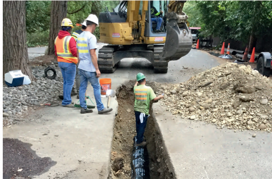
Lake Steilacoom Drive project