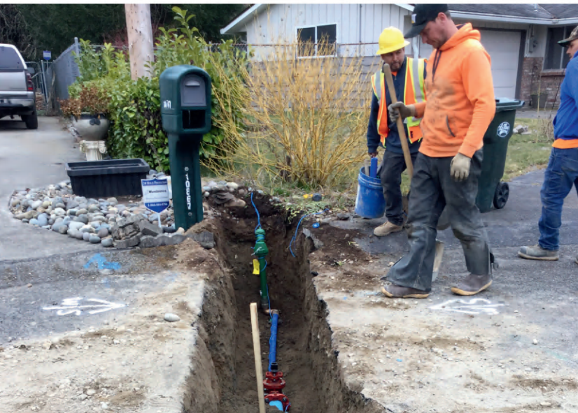
Arrowhead Phase 2 old pipe replacement

This project is being built in conjunction with funding from the State of Washington. This project will replace the existing air-stripping towers that have been in service there for nearly 30 years with new stainless-steel air-stripping towers that will last in excess of 60 years. In conjunction with this project, LWD is installing two Granular Activated Carbon treatment systems (GAC). This is to treat the water that has elevated levels of perflourinated compounds that we suspect are residual from firefighting foam used on the joint base. The project was started in March of 2019 and is anticipated to be complete by October of 2019.