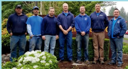
LAKWOOD WATER DISTRICT PUMPING DEPARTMENT