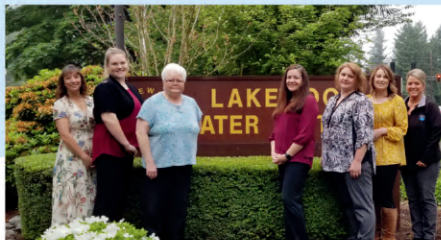
LAKWOOD WATER DISTRICT CUSTOMER SERVICE TEAM