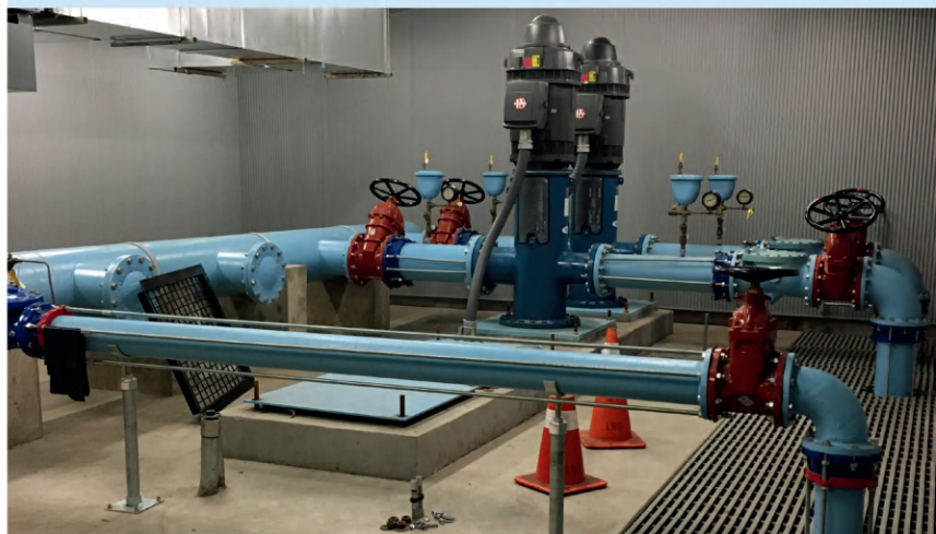
Existing Wholesale Booster Station

This project will extend our existing wholesale main from 120th to Vickery, down Vickery to 128th eastward to Bingham, down Bingham which changes to 152nd east, then south on Woodlawn, then east on 160th to 74th Ave, then south to 74th and 176th. This will extend the main nearly seven miles (35680 LF) and will allow the sale of water to not only Summit Water & Supply Co. but also Spanaway, Firgrove Mutual, and Rainier View Water Companies. This will be a 20-inch main capable of moving up to ten million gallons a day to these and future wholesale customers.