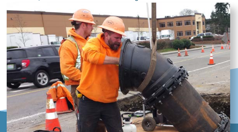
Contactors lower 20-inch pipe for water main installation

This project was designed and engineered in 2014 by Parametrix Engineers, with an Engineer's Estimate of $350K. This project consisted of extending the 20-inch transmission main by 1115 linear feet from the end of the Orient Street Crossing under I-5 to the wholesale transmission main in South Tacoma Way. Waunch Construction & Trucking was awarded the project for $276K. Construction started February 3 and was completed March 3, 2015, ahead of schedule and below budget.