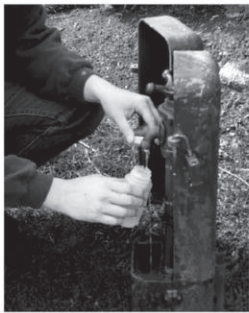
Taking monthly bacteriological samples

• The District performs a MINIMUM of 840 coliform bacteria tests per year (70 per month) and has not had a positive test result in over ten years.