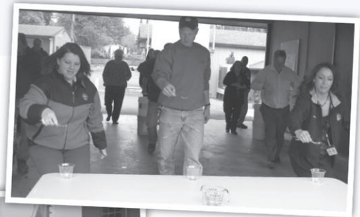
District Staff Play “Deliver the Water” Race