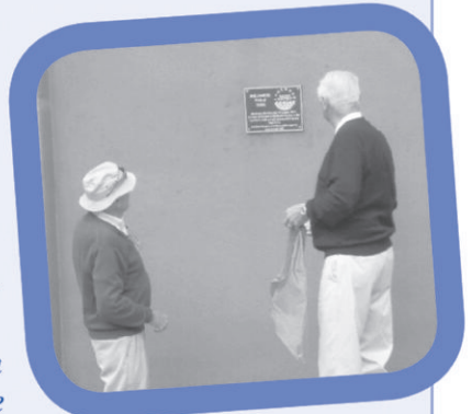
The unveiling of the dedication bronze plate.