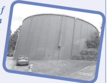
Our largest tank: the 8-million-gallon William W. Philip Tank.

Have a good day. Your Board of Commissioners