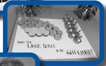
From work force to golf course — This one speaks for itself!