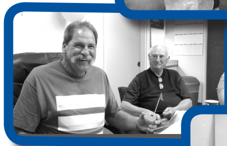
Is that a hole-in-one about to happen on his cupcake?