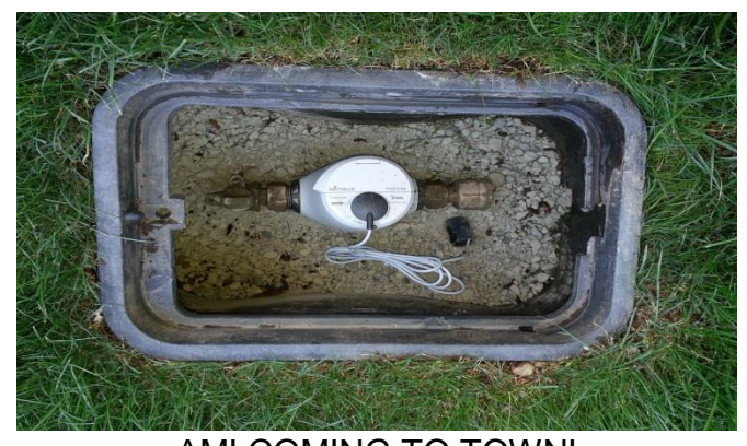
AMI COMING TO TOWN!

Providing safe, reliable drinking water will remain our highest priority throughout the project. If you have any questions or feedback, you can either visit our website or contact us directly. On our website at <a href="www.lakewood-water-dist.org">www.lakewood-water-dist.org</a>, please follow the "AMI COMING TO TOWN!" meter box icon/link to take you to more information on our AMI Meter Replacement Program.